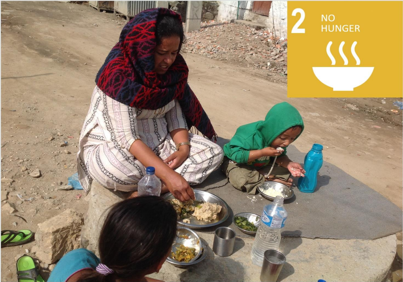
Goal 2: End hunger, achieve food security and improved nutrition and promote sustainable agriculture